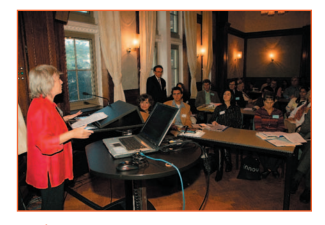
Local Community Session

answer to the question of whether we should have community-based or local government-led process, participants felt that both the community and the local authority need a common awareness and understanding of the Earth Charter. Local governments should see the complementarity of the Earth Charter and Local Agenda 21.