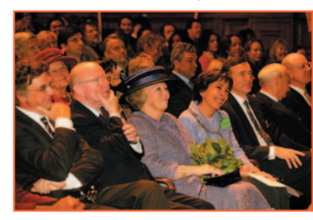
rights, Queen Beatrix at closing plenary

Such a shift requires nothing less than establishing new "ethical foundation for the emerging world community" based on "respect for nature, universal human rights, economic justice, and a culture of peace."