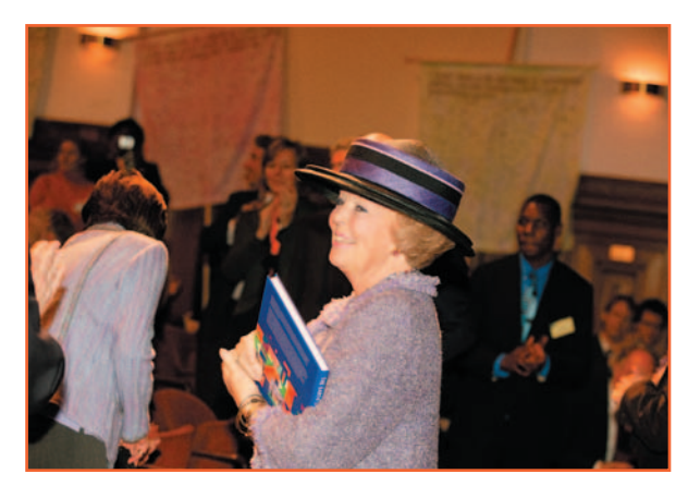
The Queen and the book

The essays, together with artwork from around the world inspired by the Earth Charter, illustrate the document's capacity to reach across cultures and sectors, and to turn principles into practice. Published by the Netherlands Royal Tropical Institution (KIT Publishers), The Earth Charter in Action can be ordered at the website below, or via email through Maurits von Heijden at m.v.heijden@kit.nl.